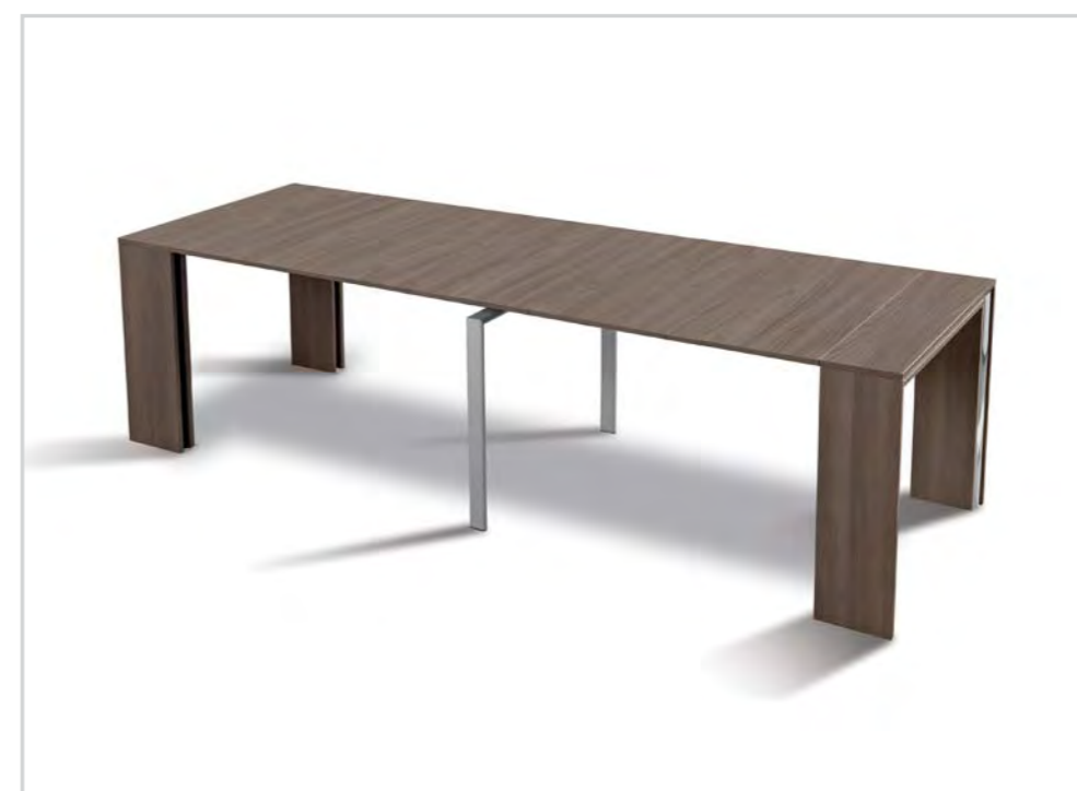
O/400.L 5 allunghe (extensions) aperto max (max extension): cm 270(45+5x45)x90x75h chiuso (closed): cm 90x45x75h