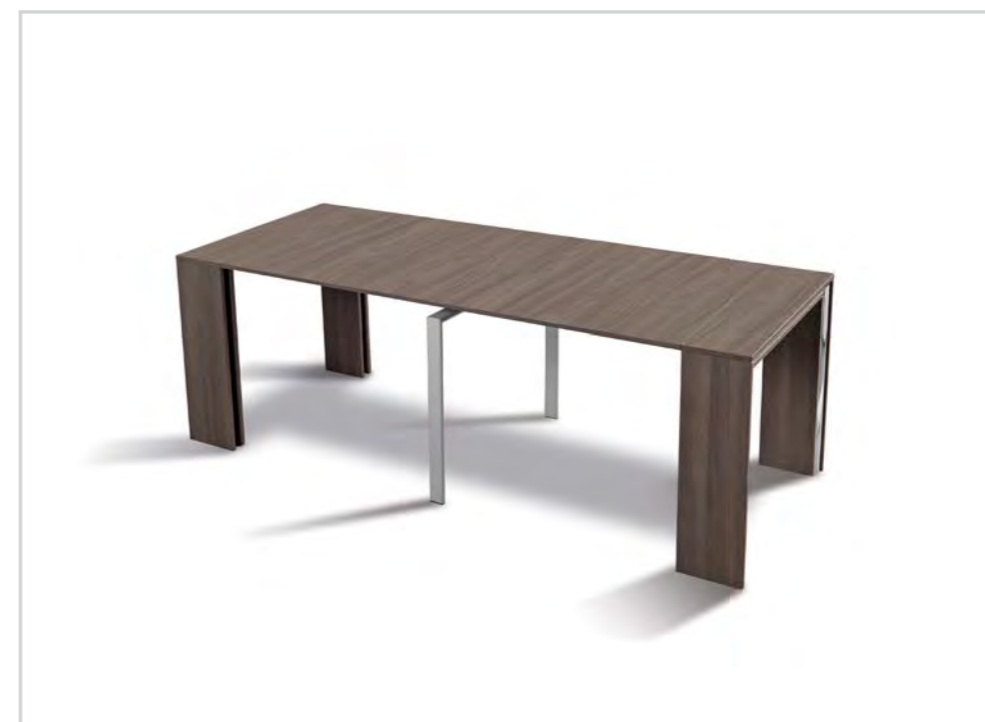
O/400 4 allunghe (extensions) aperto max (max extension): cm 225(45+4x45)x90x75h chiuso (closed): cm 90x45x75h